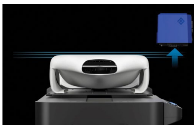
Rapid loading with tool-less macro and auto fine height adjustment