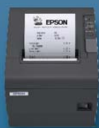
Thermal Receipt Printers